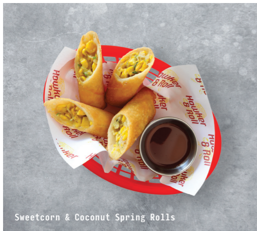
Sweetcorn & Coconut Spring Rolls

Malaysian Fries with Sriracha Mayo (V) (GF) 7