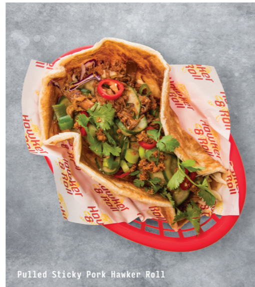
Pulled Sticky Pork Hawker Roll