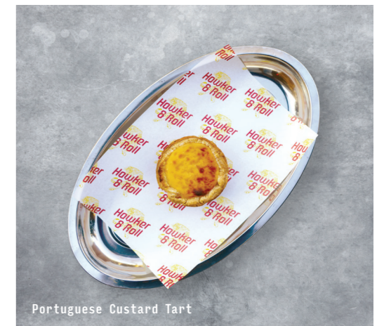
Portuguese Custard Tart

Kids Bowl & Rice Beef, Pork or Chicken 9