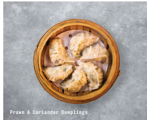
Prawn & Coriander Dumplings